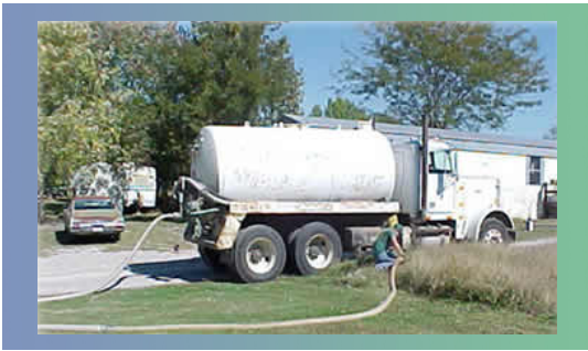
A licensed septic hauler can clean your tank.