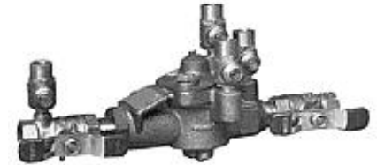
Reduced Pressure Backflow device

The type of protection required is based on the potential for backflow and the degree of hazard to the public water supply.