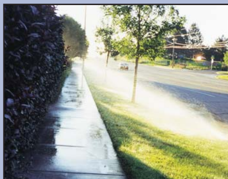
TIP: Make sure sprinklers are watering the grass and not the sidewalk

To learn more about Xeriscaping and these seven key principles, please visit BCDES's Web site at www.butlercountyohio.org/des .