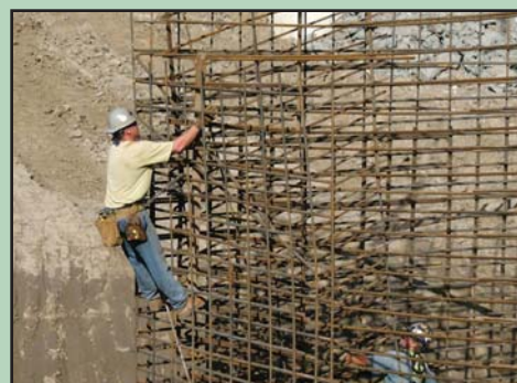
Crews work on construction of the water reclamation facility

To assist New Miami, BCDES offered to request and administer additional funding, as well as to construct and operate the sewer system. In 2005, BCDES began operating the Village's antiquated facility and began construction of a new wastewater collection system, lift station and wastewater reclamation facility. The new infrastructure will provide sewer service for New Miami and the surrounding area. The water reclamation facility will provide treatment of 900,000 gallons per day and will replace a plant that currently serves the Cherokee Park subdivision.